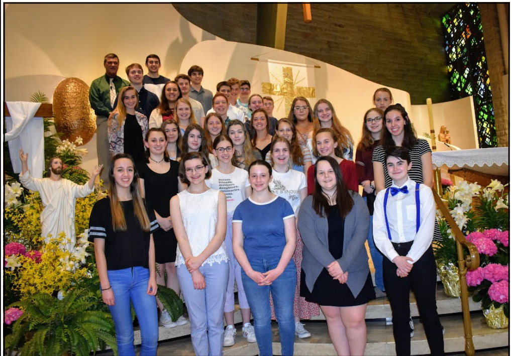
Members of our 11th Grade Confirmation Class.